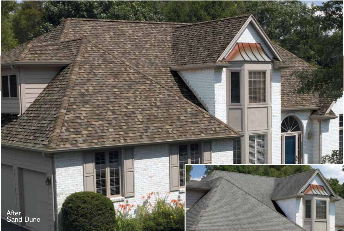
After Sand Dune